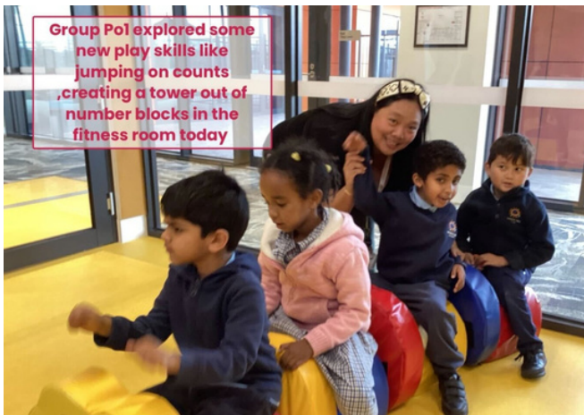
Group Pol explored some new play skills like jumping on counts ,creating a tower out of number blocks in the fitness room today