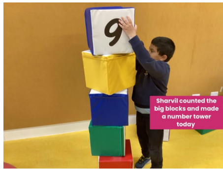
Sharvil counted the big blocks and made a number tower today