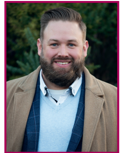
Warringa Crescent Campus