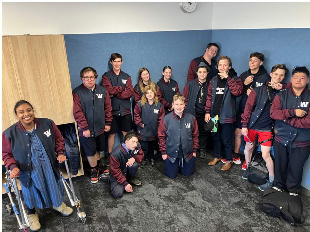
Year 12 students enjoying their new jackets